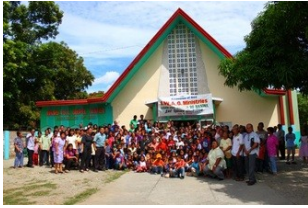
I.W.A.G. Ministries Family