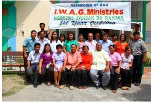
The Pioneers and Leaders

The major project of I.W.A.G. Ministries, the Vision 2015: IWAGAN RO BANWA (Light the Town), had celebrated the 1st Year Jubilee last July 4, 2010 after a year when the project was unveiled last July 5, 2009. With God's direction and intervention, we are certain we will realize the goal of having an organized outreach centers with at least 15 baptized believers in 30 barangays of Ibaday, Aklan, Phils. (Ibaday has 35 barangays but 4 of those are within